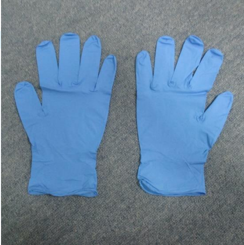
Samples described as Disposable Nitrile Glove